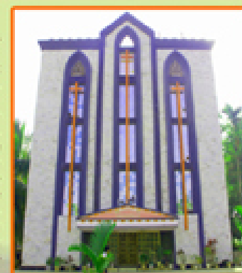
Church Building at Rampachodavaram