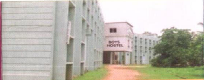
BOYS HOSTEL, LENORA COLLEGE OF ENGINEERING

QUALITY : Qualified, eminent and experienced faculty are available. Apart from teaching, the faculty have attended National Level Seminars, Conferences, Refresher Courses, Workshops, QIPs and have presented various Technical papers at different platforms.